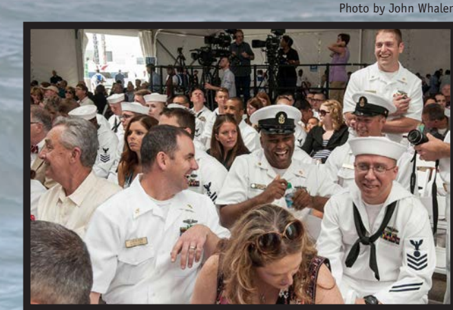
Crew members of submarine Indiana share a laugh before the ceremony starts.