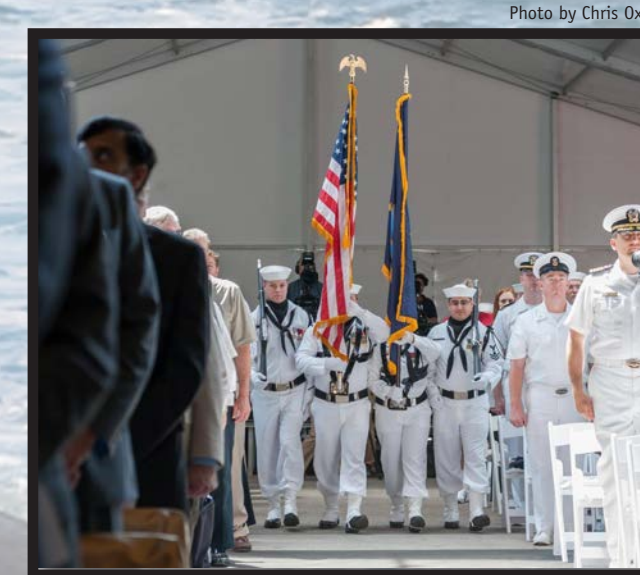
The Submarine 6 Command Color Guard presents the Colors at the beginning of the ceremony.