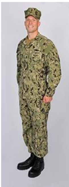
click image for arger picture