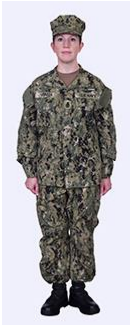
click image for larger picture