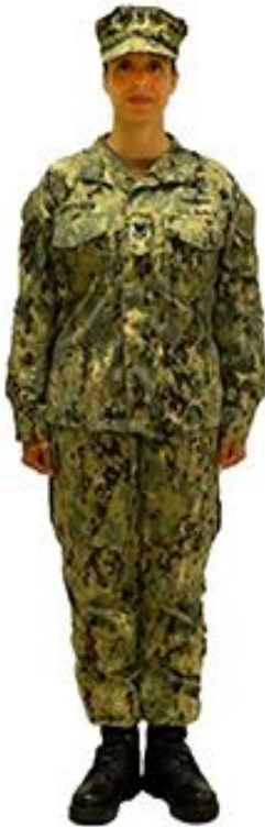
click image for larger version