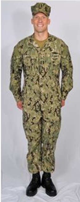
click image for larger version