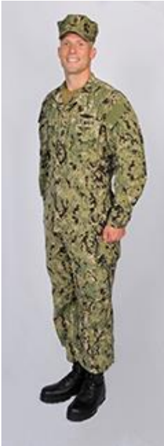
click image for arger picture