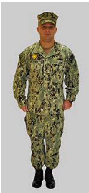
click image for larger version