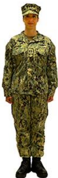
click image for larger version