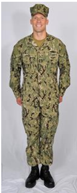
click image for larger version