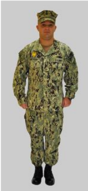
click image for larger version