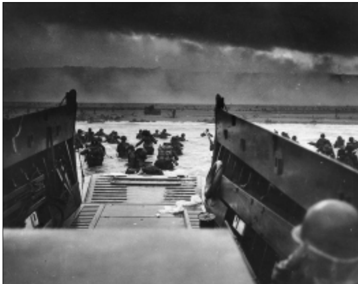
Army troops wade ashore on "Omaha" Beach during the "D-Day" landings, 6 June 1944. They were brought to the beach by a Coast Guard manned LCVT.