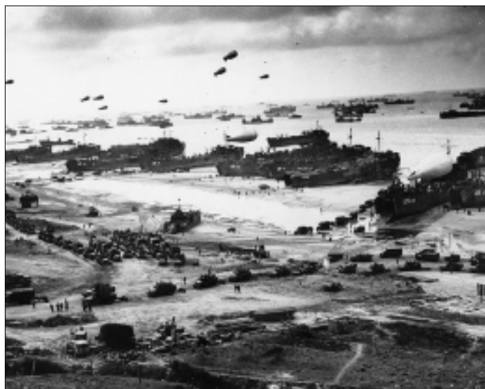
Landing ships putting cargo ashore on one of the invasion beaches, at low tide during the first days of the operation, June 1944. Among identifiable ships present are USS LST-532 (in the center of the view); USS LST-262 (3rd LST from right); USS LST-310 (2nd LST from right); USS LST-533 (partially visible at far right); and USS LST-524. Note barrage balloons overhead and Army "half-track" convoy forming up on the beach.